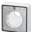
WV-QJB500-W Mount Bracket