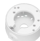
WV-QJB502A-W Mount Bracket