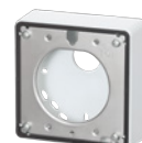
WV-QJB500-W Mount Bracket