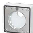
WV-QJB500-W Mount Bracket