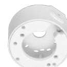
WV-QJB502A-W Mount Bracket